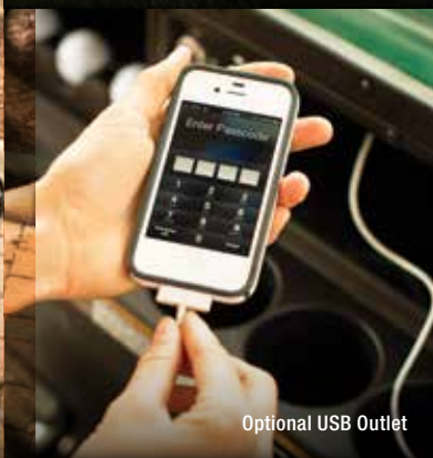
Optional USB Outlet