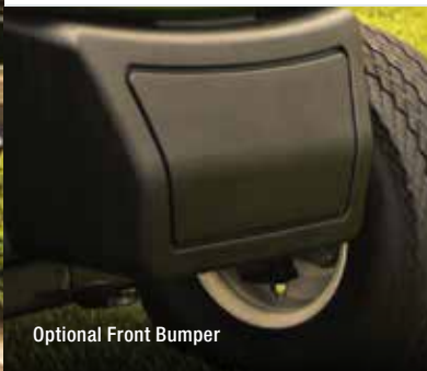
Optional Front Bumper