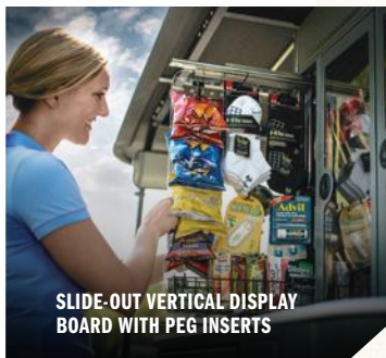
SLIDE-OUT VERTICAL DISPLAY BOARD WITH PEG INSERTS