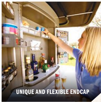
UNIQUE AND FLEXIBLE ENDCAP