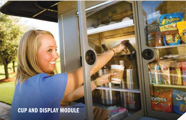
CUP AND DISPLAY MODULE