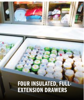
FOUR INSULATED, FULL- EXTENSION DRAWERS