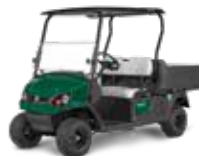
HAULER 1200 & 1200X