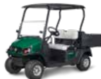
HAULER 800 & 800X