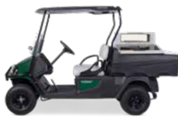
INSTALLED ON HAULER 1200