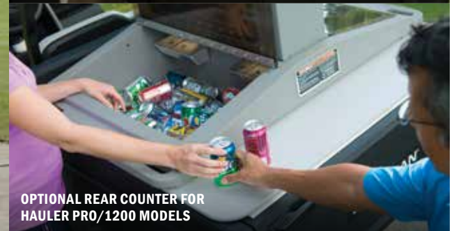
OPTIONAL REAR COUNTER FOR HAULER PRO/1200 MODELS