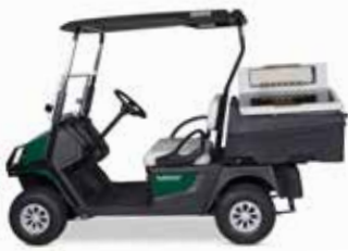
INSTALLED ON HAULER® 800