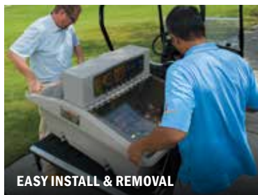
EASY INSTALL & REMOVAL